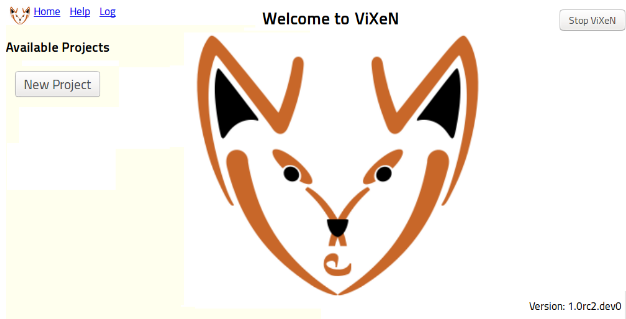
Fig. 1: Start page when ViXeN is started for the first time.

When you first start you will have a rather empty page with a button on the left panel to create a new project as seen in the figure below: