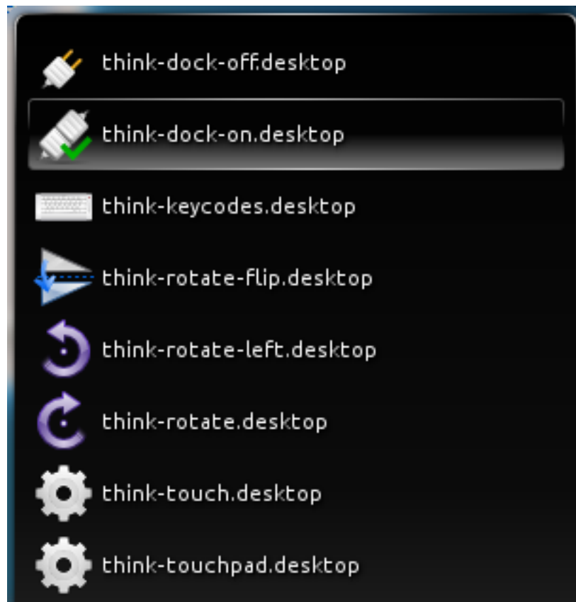
Fig. 2: KDE Plasma Panel drawer with all thinkpad- scripts.