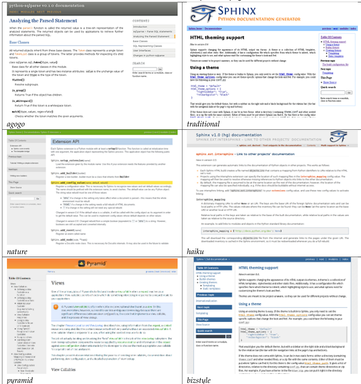
Table 1 – continued from previous page

Sphinx comes with a selection of themes to choose from.