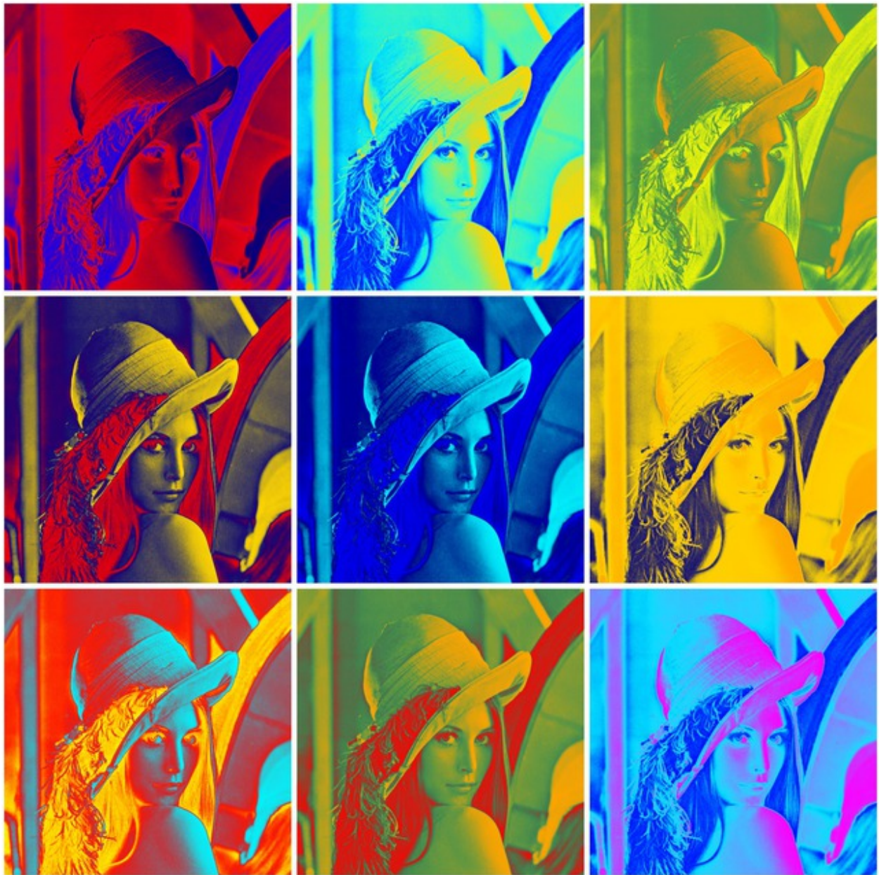
Fig. 2: Warholized version of Lena