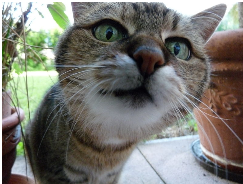
Fig. 1: Full size: 800x600. This photograph, by Wikipedia user Sloesch , is licensed as CC BY-SA .

Let's use {% adjust %} with width 200 (25%) and height 300 (50%), with three of the built-in adjustments.