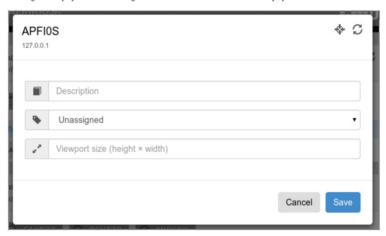
Figure 4.2: The dialog box of the APFIOS display.

Clicking on a display will show a dialog box with various information about the display.