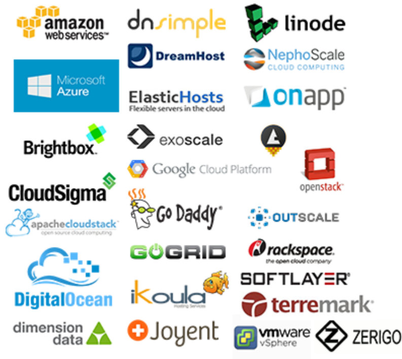
Fig. 1: A subset of supported providers in Libcloud.